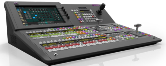
GV Korona 2 M/E Switcher

Setting up a 4K UHD show has never been easier than with a unique EZ 4K frame operating mode that automatically gangs buses, ImageStore channels and I/Os. Supporting up to three 4K UHD M/Es each with two full function keys and an optional channel of iDPM, you will produce extremely high-quality content. The conversion I/O boards offer 12G-SDI for single link connectivity reducing cabling requirements and gearboxing of 4K UHD signals to move between single link and quad link video formats.