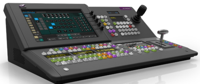
GV Korona 1 M/E Switcher