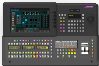
GV Korona 1-Stripe Control Panel (KOR-PNL-100-15)

Includes one 15-button source select stripe, one 20 meter Ethernet cable, and a system control area with device control, switched preview, alternate bus and aux bus delegation, and macro controls, with controls for background and keyer source selection, multi-function and E-MEM area, horizontal keyer cut/mix, multi-function keypad and display. Includes built-in multi-touch display and menu system.