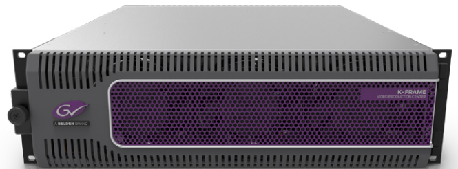
GV Korona K-Frame V-series 3 M/E 25-button system