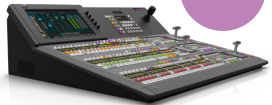
GV Korona 3 M/E Switcher

Out of the box, GV Korona K-Frame V-series provides you with 3G/1080p and 4K UHD (quad-split and 2SI) support capabilities, up to 3 M/Es plus two additional and powerful Video Processing Engines (VPEs) for all the no-compromise mixing and keying power you will ever need. Its native 10-bit 4:2:2 processing even supports High Dynamic Range (HDR). This is real big switcher performance in a small form factor with a lower CAPEX cost than previously available.