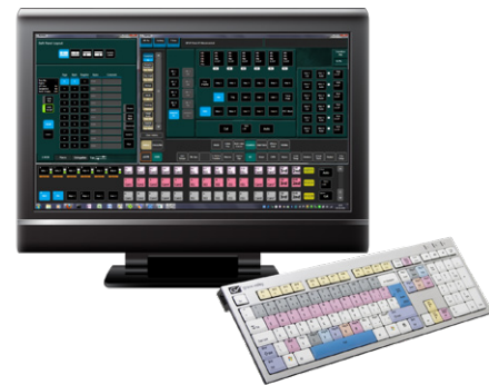
KSP Control Surface provides a software and keyboard option for operating K-Frame.

License enabling control of the K-series video processor frames with the 1 M/E soft panel GUI on a customer supplied PC. Suggest the KSP-PNL-1ME-KBD option.