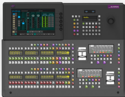
GV Korona 2-Stripe Control Panel (KOR-PNL-200-20)

Includes two 20-button source select stripes, one 20 meter Ethernet cable, and a system control area with device control, switched preview, alternate bus and aux bus delegation, and macro controls, with controls for background and keyer source selection, multi-function and E-MEM area, horizontal keyer cut/mix, multi-function keypad and display. Includes built-in multi-touch display and menu system.