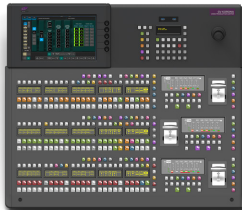
GV Korona 3-Stripe Control Panel (KOR-PNL-300-25)

Includes two 25-button source select stripes, one 20 meter Ethernet cable, and a system control area with device control, switched preview, alternate bus and aux bus delegation, and macro controls, with controls for background and keyer source selection, multi-function and E-MEM area, horizontal keyer cut/mix, multi-function keypad and display. Includes built-in multi-touch display and menu system.